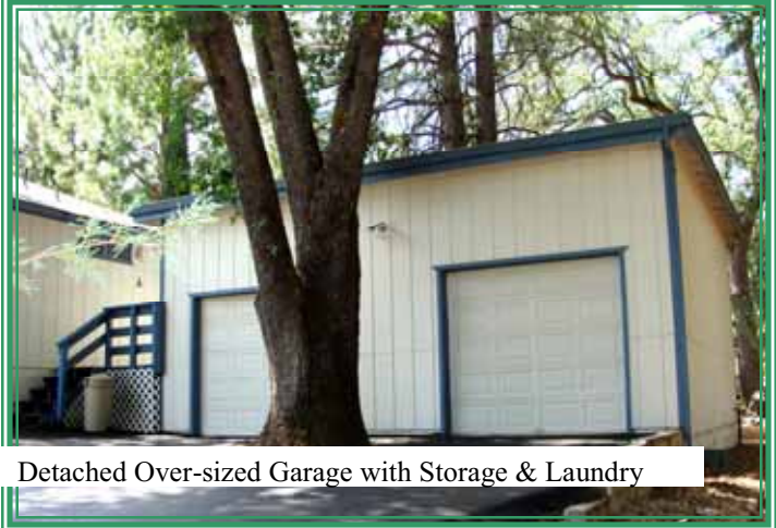
Detached Over-sized Garage with Storage & Laundry